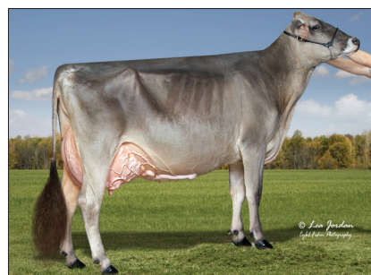
Nor-Bert Thunder Silverflake E92/92ms *CERTIFIED*

MULTIPLE AWARD WINNER NOR-BERT FARM OF BREMEN, IN , is the recipient of the Ira Inman PTPR Trophy for Group 2 (30-49 cows) . They also received three National Production Awards for their Brown