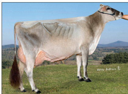
IE Twinkle-Hill Bush Jengus 2E93/93ms