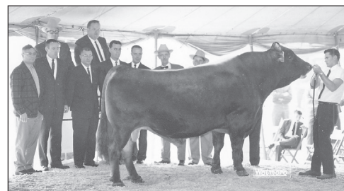
Welcome In Charmer