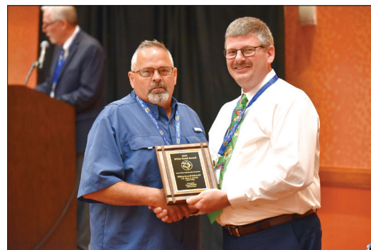
2021 WHITE CLOUD AWARD HIGHEST EMC UNDER 2-0