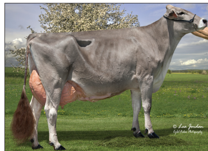
We Sell Bose 4708 E94/94ms (pictured)

5/02 365d 2X 32,899m 4.4% 1,434f 3.5% 1,159p