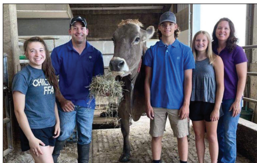
2021 LIVING LIFETIME COW AWARD - ECM