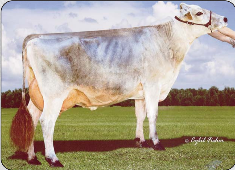
Cozy Valley Lebron Droid 'E92 - E92ms'