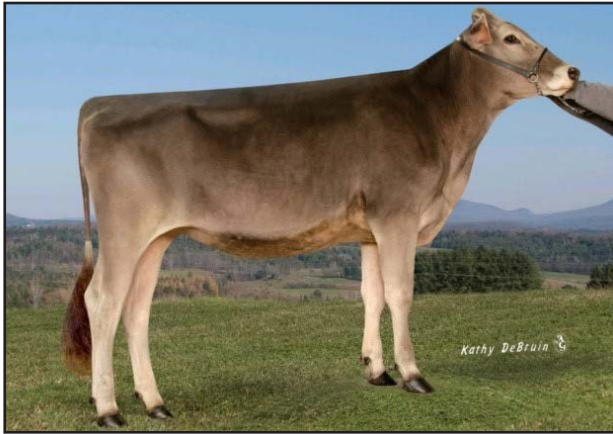
DSKM Foremost Valedictorian Grand Champion SD State Fair 2020 Junior Champion SD State Fair 2020 - Selling Lot 58