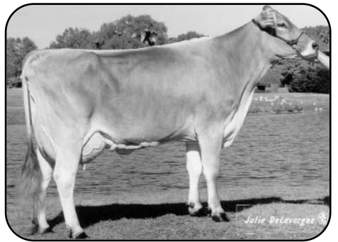
Genesis Even Victoria 'E93 - E93ms' *Certified* 6/05 365d 2x 36530 4.3 1558 3.7 1348 DHIR Dam of Sun-Made Vigor ET *TM Maternal Sister of Lot 105