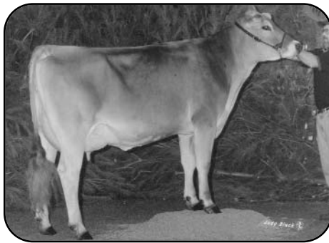
Misa Prophet Mirage '2E91 - V88ms' *Certified* 5/02 365d 2x 31280 3.9 1218 3.2 1003 DHIR Hon Men All Am Jr 2 Yr Old 1998 Dam of Lot 104