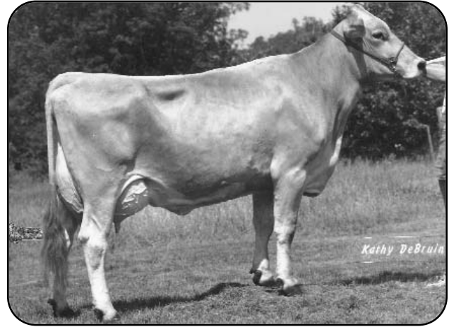
V B Reyna Elrosa (W*) '3E91 - E92ms' *Certified* 6/05 365d 2x 26560 3.8 1012 3.1 830 DHIR Reserve All American 5 Year Old 1992 - MGD of Lot 102, 103