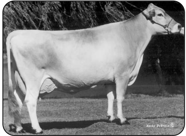
Mort Matt Tammy '3E90 - E90ms' *Certified - SBC* 5/02 365D 2X 24950 4.4 1093 3.6 898 DHIR Nom All American 5 Yr Old 1990 - MGD of Lot 66