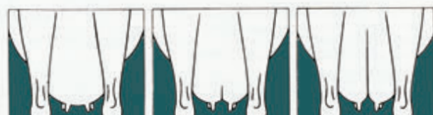
Negative Cleft, Broken Support