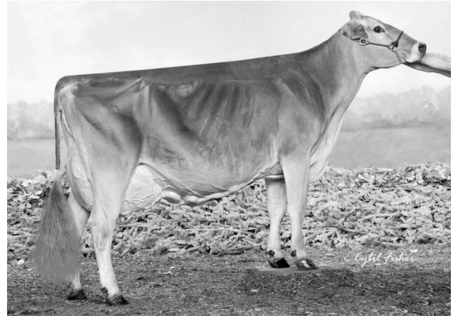
Cutting Edge Stratus Sue 68137249