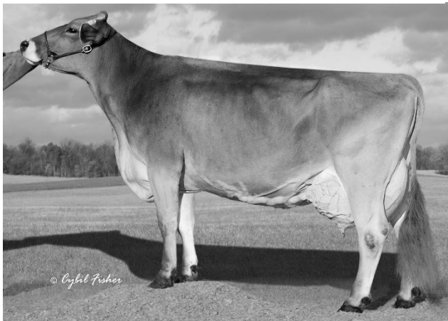
Lost Elm Prelude Pixy ET 911151