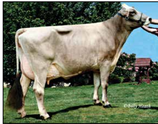
DUBLIN HILLS SASHA '5E93'