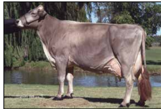
SUN-MADE JETWAY SHATZI ET '4E94'