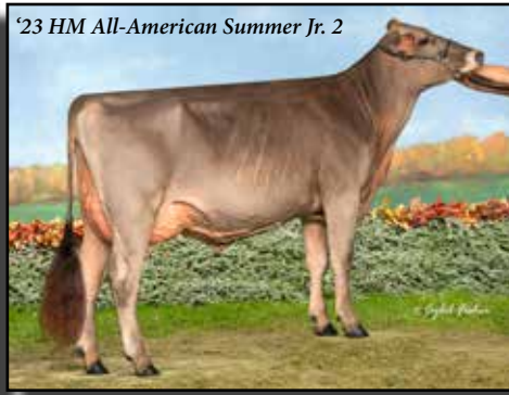
'23 HM All-American Summer Jr. 2