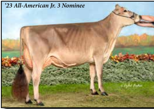
'23 All-American Jr. 3 Nominee