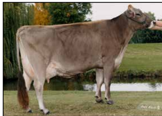
BLUE HEAVEN JW SNOWPLOW 'EX94'