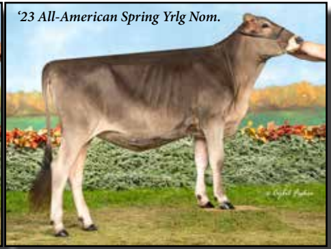
'23 All-American Spring Yrlg Nom.