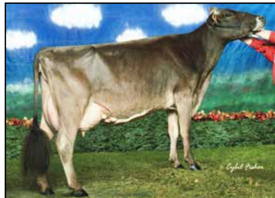
KULP GEN STARBUCK SHANIA '4E94'