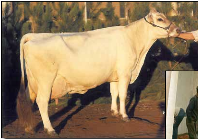
KILRAVOCK SNOW STORM '5E90' ELITE SUPERIOR BROOD COW | ALL-AMERICAN NATIONAL TOTAL PERFORMANCE WINNER J.P. EVES AWARD