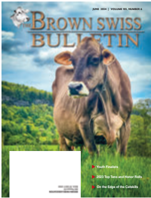
Monthly Association Magazine 10 issues/year (July-Aug & Oct-Nov combined)