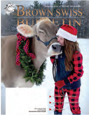
Monthly Association Magazine 10 issues/year (July-Aug & Oct-Nov combined)